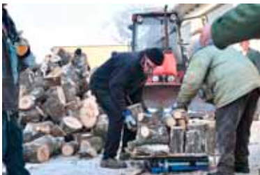
During winter, the Hungarian Lutheran church distributes wood and food to marginalized families in the country including Roma people.